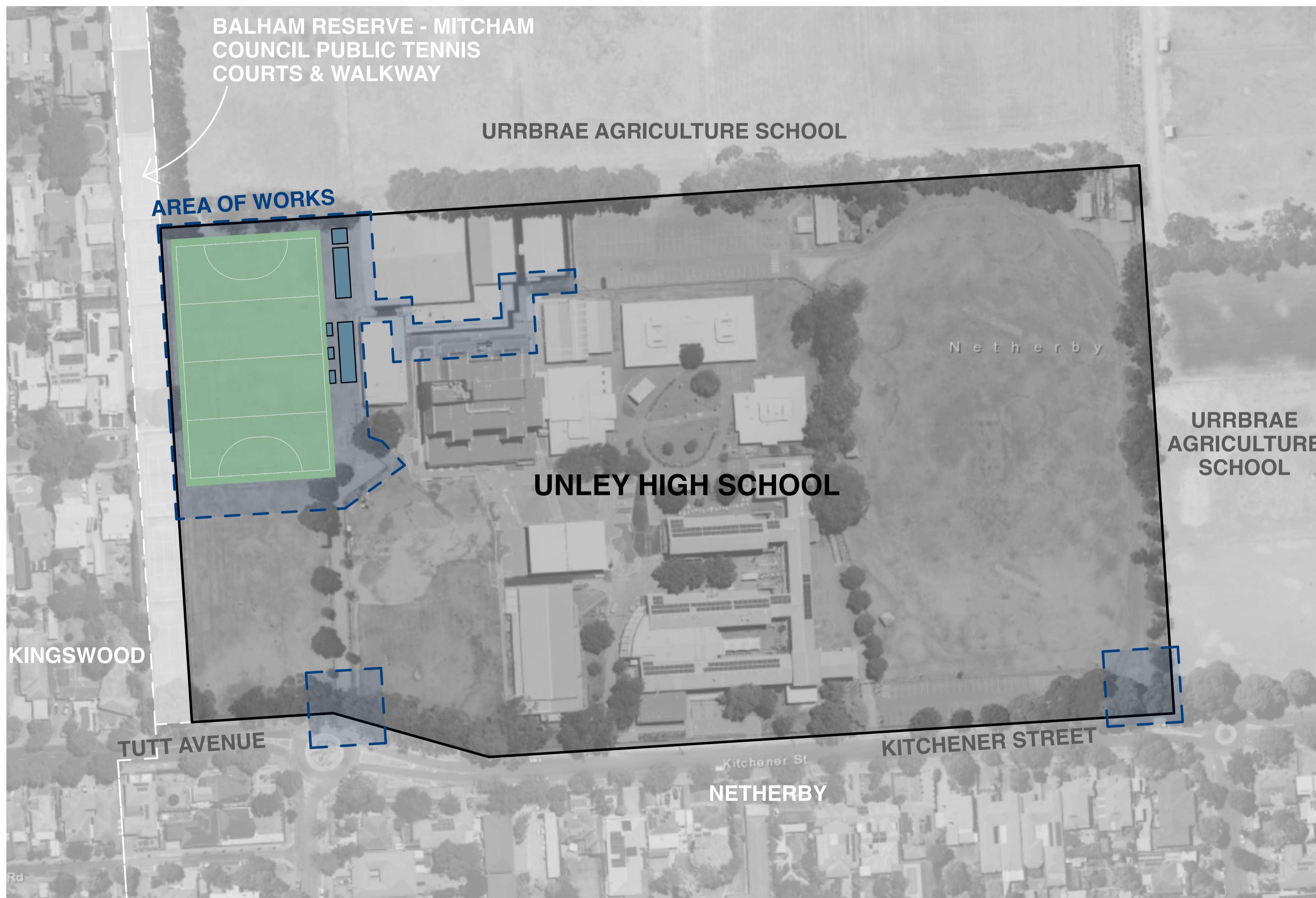
Location Plan Scale 1:1000